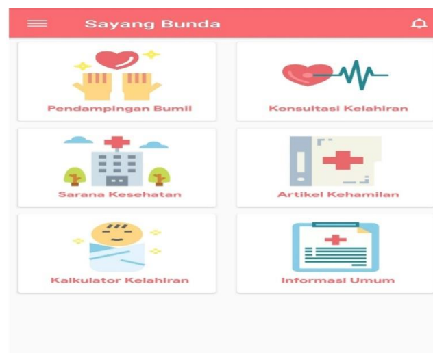
Figure 2. Menu of "SAYANG BUNDA" application

Menu of "SAYANG BUNDA"-android application includes pregnant women facilitation, birth consultation, proximate healthcare center, pregnancy article, date of delivery calculator, and general information.