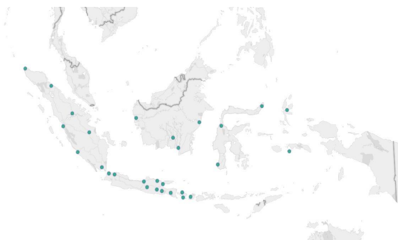
Figure 1. Distribution of the location of participant institutions (blue dots) involved in the study

This research was a survey research with quantitative approach. The participants of this study were alumni of Biology students from various universities in Indonesia. The instrument used was an online questionnaire through Google Form . The questionnaire consists of two parts: 1) the part that asks participants 'identities; and 2) the part that asks participants' learning experiences during take genetics course. Several aspects were asked in the questionnaire, namely (1) the subjects that were considered the most difficult during the undergraduate level; (2) the existence of Genetic Practicum; (3) the use of Drosophila melanogaster in the Genetic course; and (4) types of activities that utilize Drosophila melanogaster during practicum.