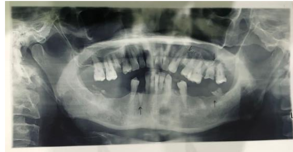
Figure 3. Panoramic Examination Results