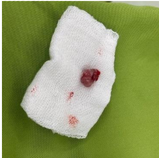
Figure 2. Tumor Masses That Have Been Excised