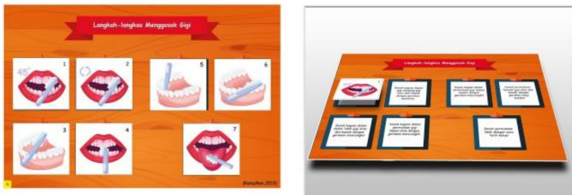
Figure 1. Media pop up books

The tools and materials needed include an OHI-S assessment sheet which contains an assessment of the debris index and calculus index, media pop-up books and a pocket book which consists of dental and oral hygiene materials, factors affecting dental and oral hygiene, types of teeth, the process of cavities, good and bad foods for oral health, good and right way to brush your teeth, and how to maintain healthy teeth and mouth. Other tools needed include writing instruments, teeth brushing props (phantom), dental kits, nierbeken, dappen glass, and trash cans. The research materials needed include masks, handsoons, alcohol, cotton rolls, mineral water, tissue, and disclosing agents.